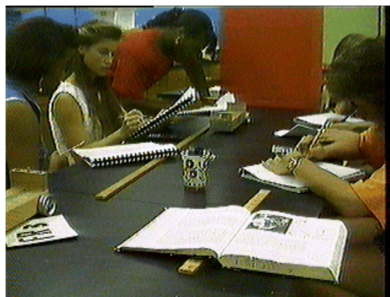
Figure 1: Traditional hands-on activities as well as interactive multimedia are used in the explorations and applications.

The applications are graded on a scale of 0 to 8. In this case, grades are based on the students' abilities to use physics concepts in their explanations and to use those quantitative relationships presented in the class and text.